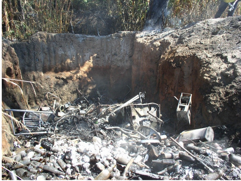
Figure 6 - An example of a burn pit found by District inspectors.