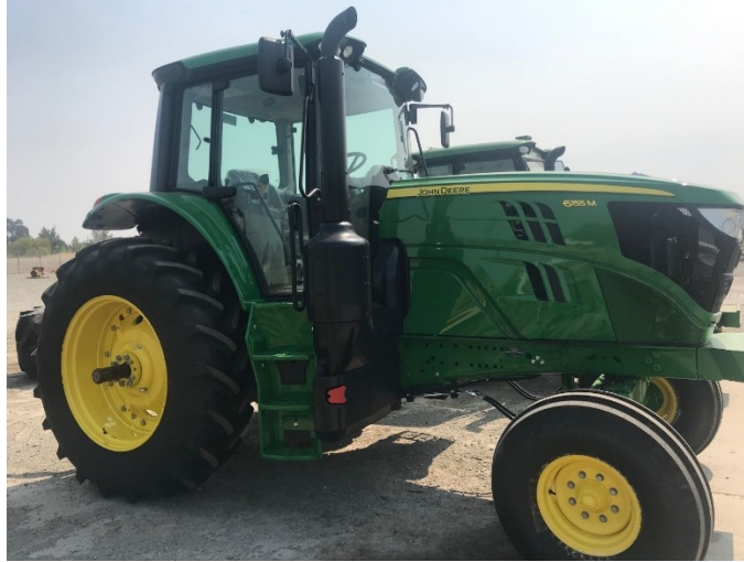
Figure 4 - An example of a new tractor funded under the District's grant programs.

The Planning and Engineering Division administers several incentive grant programs with both local funding and funding from the State. Available grant funding annual varies by program from around $150,000 in the locally funded Blue Sky Grant to over $1 million in the cap and trade funded grants. Most of the funding is for agricultural equipment upgrades and school bus replacements. A list of active grant programs is online at www.fraqmd.org/grant-programs .