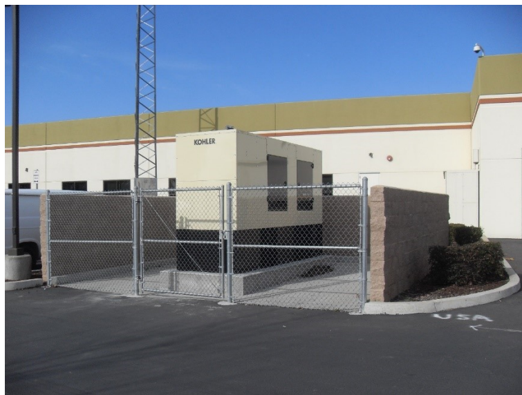
Figure 3 - An example of a permitted source (backup generator)

An air district permit must be issued prior to the building or installation of a regulated device. A permit ensures that the device does not prevent or interfere with the attainment and maintenance of any air quality standard, and that the device will comply with the rules and regulations of the District, ARB, and US EPA. Permits are renewed annually and may also be modified at the request of the owner/operator throughout the year.