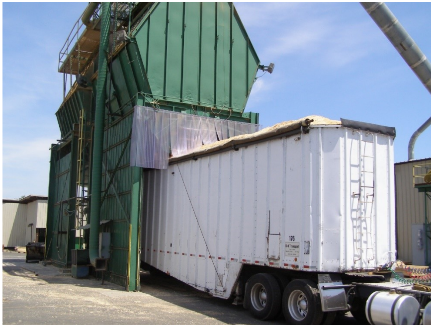
Figure 5 - An example of a permitted source dumping wood shavings into a trailer for reuse elsewhere

The Compliance Division is responsible for all permitted sources, currently around 650, and all burn permits, currently around 1500, issued within the District. Routine inspections help ensure emission reductions written into regulations are achieved in practice. All District permits are inspected annually. Larger federal facilities (Title V) have more complex inspection requirements.