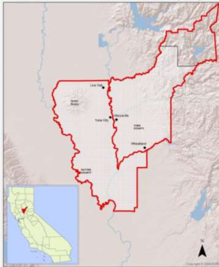
Figure 2: Yuba City-Marysville Nonattainment Area for PM2.5

The second maintenance plan for the 2006 24-hour PM2.5 NAAQS is due in 2022. The maintenance plan will require an exceptional event demonstration as wildfire smoke caused exceedances of the PM2.5 NAAQS in 2021 and 2019. The District staff will work and consult with CARB, SACOG, and other affected agencies and partners to develop the plan. The District staff expect to bring this item to the Board for consideration in October. After adoption by the Board, the second maintenance plan will be submitted to the US EPA as a revision to the SIP.